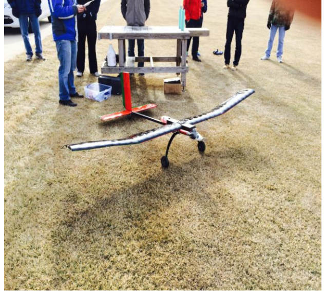
The MSOE aircraft.