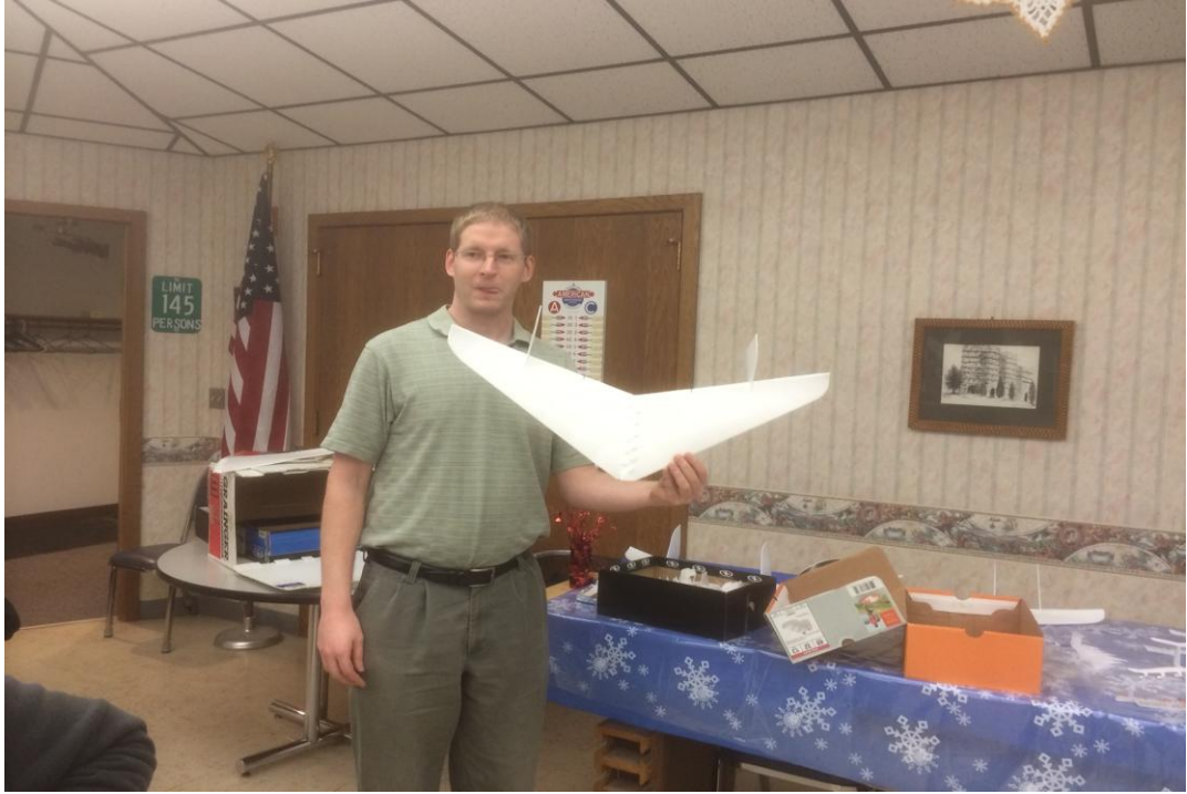
January membership meeting raffle prize winners: