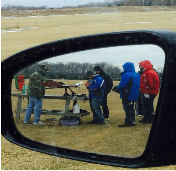
The MSOE team prepares for a test flight.