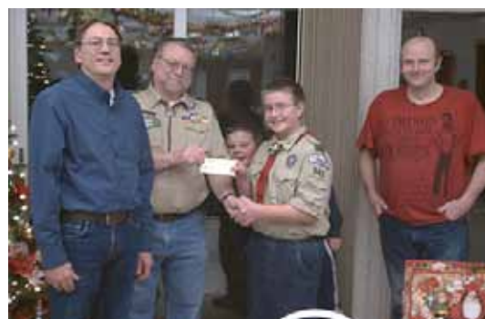
Boy Scout Troop 840 receiving their check from AstroWings.